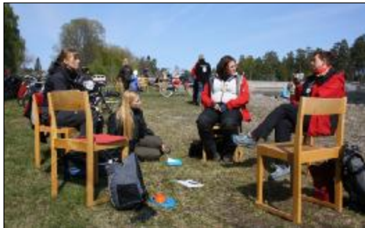
Open Space-discussions during the yearly meeting between the nature schools in Sweden on the Nature School Association's yearly meeting days which took place in Älvkarleby this year.