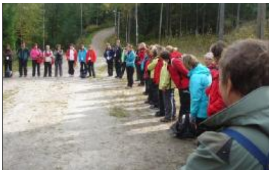
Finishing the conference “In the middle of nature” in Esbo in Finland where Nynäshamn Nature School contributed with a workshop in outdoor mathematics.