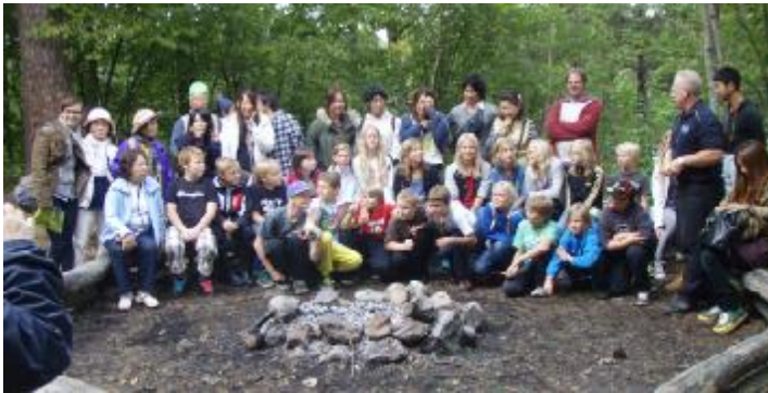
Peaceboat from Japan visited for a day and met a class from Svandammsskolan that were on camp school at the Nature School.