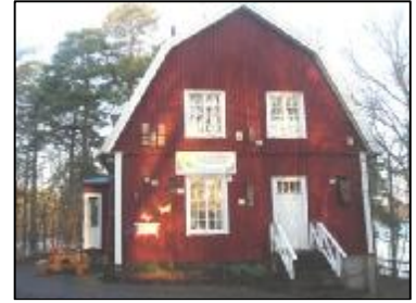
The house of Nynäshamn Nature School on Sjöudden in Ösmo in the Nynäshamn municipality.

Nynäshamn Nature School was founded in 1988 with its premises on Sjöudden at the lake Muskan in Ösmo. The Nature School receives children/pupils from the age of 4 up to 16 from all over the Nynäshamn municipality. The Nature School is not a place but a way of working based on outdoor education. The school classes have one nature school day a year – that's when they work with research around a certain theme. Before each nature school day the teacher prepares the class, and afterwards they do follow-up work at their regular school. Each school grade has their own theme, such as small insects in the forest hill, the senses, ancient technology, winter ecology, inventory at the wetlands of Alhagen, etc. Spending a lot of time outdoors in the nature at an early stage will encourage the children's sense for the nature. Consequently they will care for the nature and understand our environmental problems.