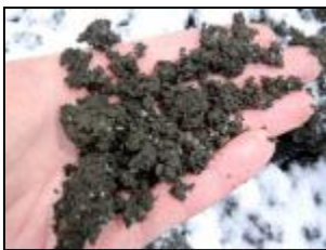
This is how the sludge looks like when it is stored before being distributed on the