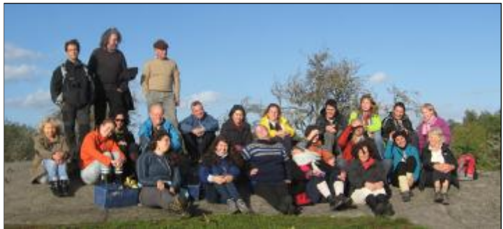
Nynäshamn Nature School contributed with a workshop in Mathematics, Swedish and English outdoors at the EU-day Outdoor Learning by Studieförbundet in Kyrkhavn in Hässelby.