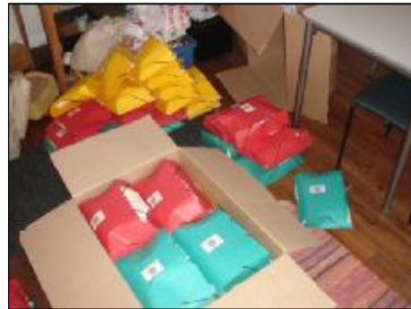
The folders of different colors for the different school grades that were sent out by internal mail.