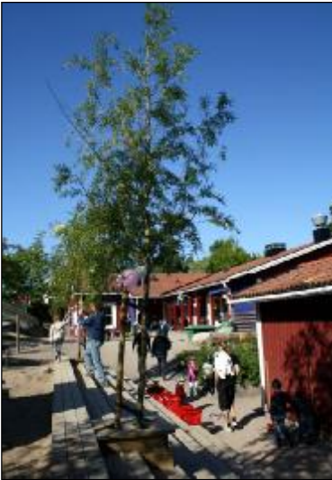
Vaktberget pre-school. A stairway to increase the activity and trees for shadows, nicely integrated in a narrow and highly sun-exposed playground.

Vaktberget pre-school. A girl is walking through the shrubbery on the part of the yard where the fence has been moved further out and new land has been incorporated. The new area stimulates to both activity and discoveries and it provides shadow when needed most, during May to August 11a.m.-15 p.m.