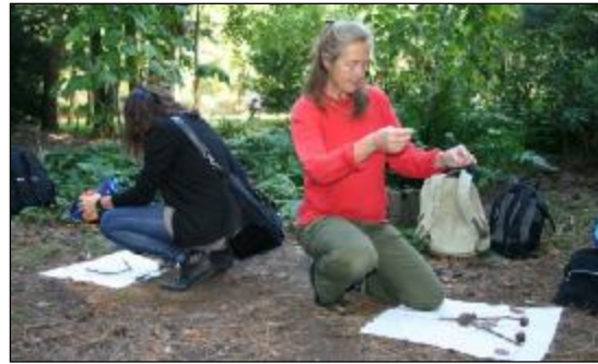
Nynäshamn Nature School contributed with a workshop in outdoor mathematics during the biggest conference in outdoor education in the Nordic Countries, i.e. “Out is cool” held in Malmö.