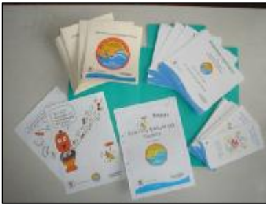
The content of the folders that were packed and sent out to all the classes in all schools and pre-schools in Nynäshamn municipality.